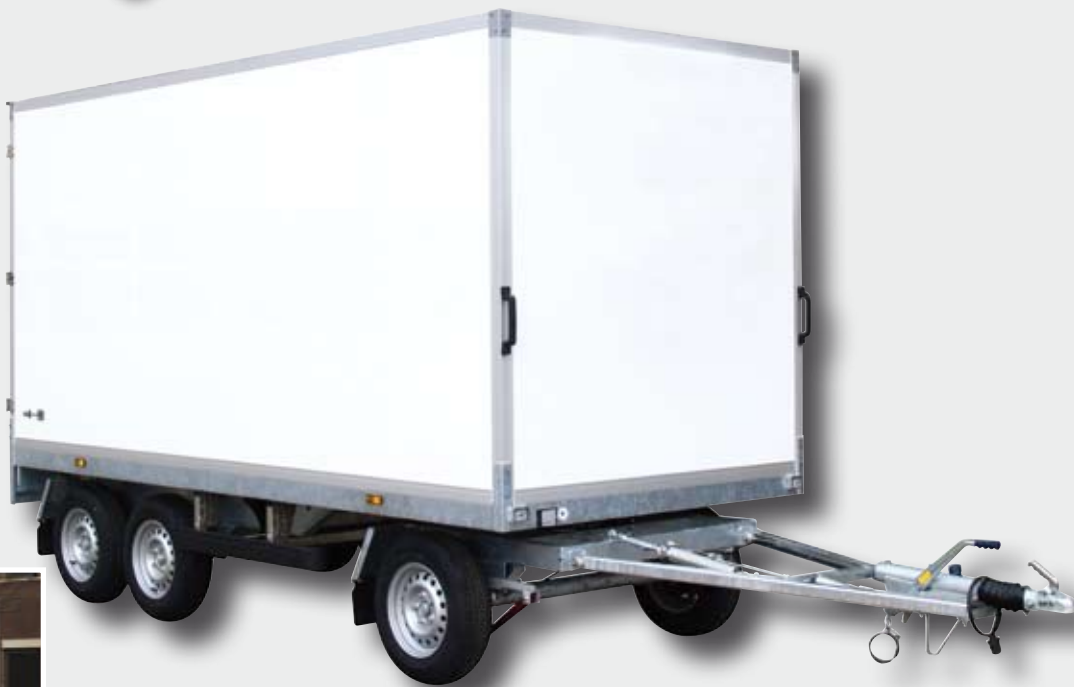
◀ Option: available with various types of windows.